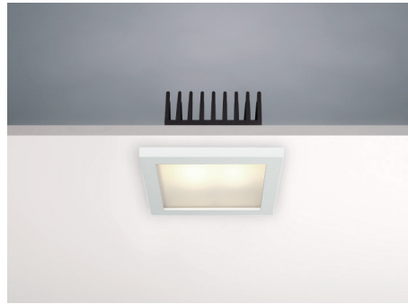
Meson square 120 with opal diffuser dual satin

Design: Team Atomis / Philip Feenstra, 2009