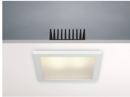
Meson square 180 with opal diffuser dual satin

Design: Team Atomis / Philip Feenstra, 2009